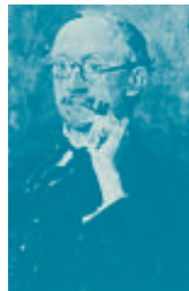
Sir Edwin Lutyens