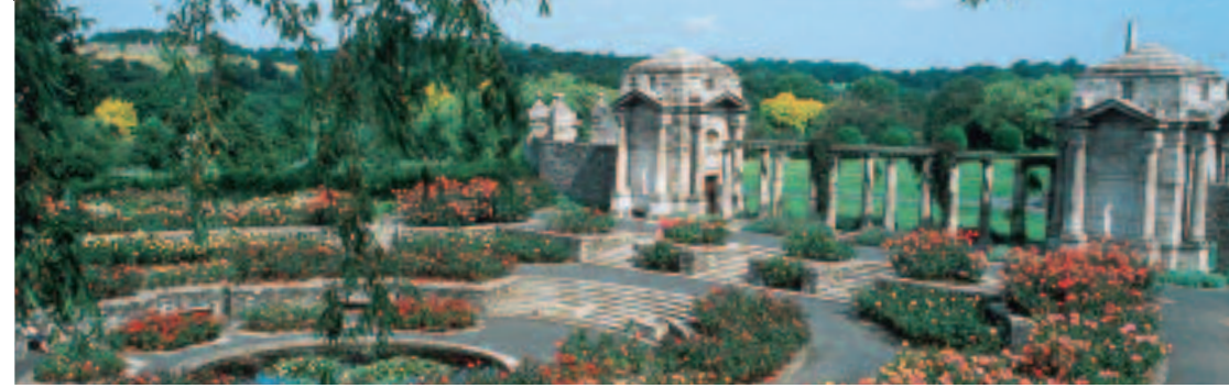
The Sunken Rose Garden.

The gardens as a whole are a lesson in classical symmetry and formality and it is generally acknowledged that his concept for the Islandbridge site is outstanding among the many war memorials he created throughout the world. His love of local material and the contrasting moods of the various 'compartments' of the gardens, all testify to his artistic genius.