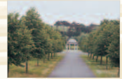
The Lime Avenue with the Temple.

Eight holly trees originally stood as 'generals' on the North Terrace overlooking serried ranks of flowering cherries or 'foot soldiers'. The formality of the lines of Prunus 'Ukon', 'Hisakura' and 'Watereri' contrasts