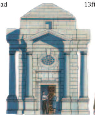
One of the four granite Bookrooms.

At either end of the lawn are two pairs of Bookrooms in granite, representing the four provinces of Ireland. These contain the Books of Remembrance in which are inscribed the names of the 49,400 Irish soldiers, who died in the First World War. One of the bookrooms now houses the Ginchy Cross, a wooden cross of celtic design, some 13ft (4m) high which was erected in 1917 as a memorial to the 4,354 men of the 16th Irish Division who died in the two engagements at Guillemont and Ginchy during the 1916 Battle of the Somme. Later replaced by a stone cross, the original cross was brought back to Ireland in 1926.