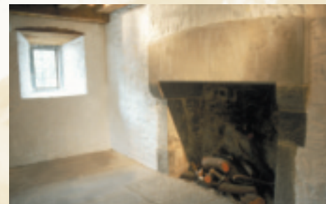
Fireplace in Ashtown Castle

The Ground Floor of a Tower House was described as “having such small apertures as to give no more light than a prison” . This description could well be applied to Ashtown Castle where the chamber is sparse and without a fireplace. The recesses and niches set in the walls may have served as cupboards and lamp shelves. The original position of the door in the south wall next to the stair tower was identified during conservation work when the locking chain ducts of the “yett”, an iron door grill, were found along with the draw-bar socket. In the alterations in the 18th or 19th centuries, the entrance to the castle was moved to the western side of the castle with musket loops covering the approaches to the door. The ground