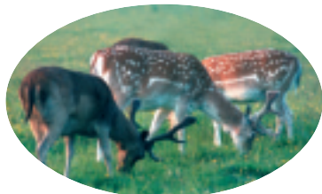
Fallow Deer in Phoenix Park

The date when Ashtown Castle was built is unclear. It was certainly in existence in the early 1600s, although it is possible that it is of an earlier period. Under a statute of King Henry VI in 1429, a grant of £10 was made available to every man in the Pale who, within ten years, built a castle of certain minimum dimensions. It has been suggested that Ashtown Castle could have been built around that time. Evidence from the roof timbers supports the view that it was roofed and partly rebuilt in the early 17th century.