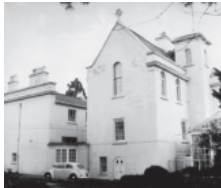
Ashtown Lodge as the Papal Nunciature