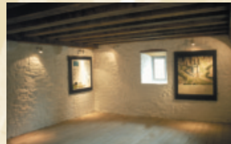
Interior Ashtown Castle

Ashtown Castle has undergone extensive rebuilding at least once in each century since its original construction. There are few identifiable features of the 15th century tower but the modest dimensions of Ashtown are similar to those specified for the “£10 castles”. Throughout the 16th century the scale and design of tower houses varied greatly. They became such a common feature of the landscape as to cause a French visitor to comment that the houses of the Irish nobility “consist of four walls extremely high” . The larger towers of those of higher rank included stone vaulted and divided chambers with elaborate defensive features. Some towers of great prestige incorporated a hall and a brightly-lit chamber at the uppermost floor.